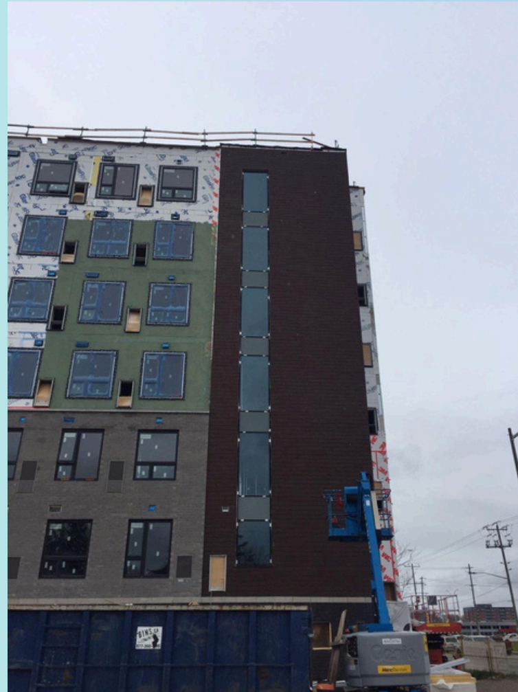
Modern Urban Residence

ACM AREA =1000 sq/ft WPC AREA =400 sq/ft