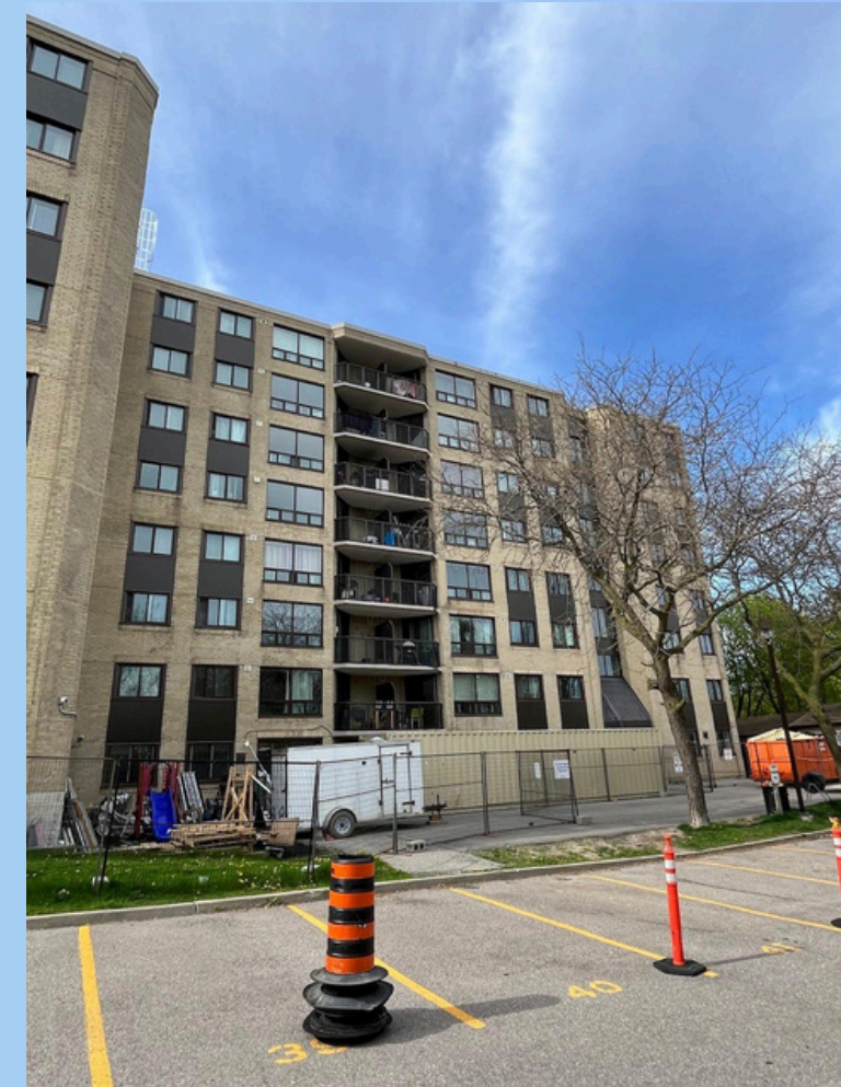
Modern Urban Residence